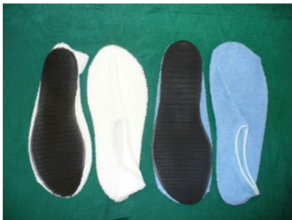
Hard Sole Slipper